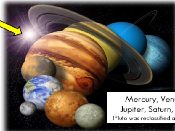
Mercury, Venus, Earth, Mars, Jupiter, Saturn, Uranus, Neptune (Pluto was reclassified as a dwarf planet in 2006)

A star at the centre of our solar system. 15 million degrees hot at its centre. It is 1.3 million times bigger than earth.