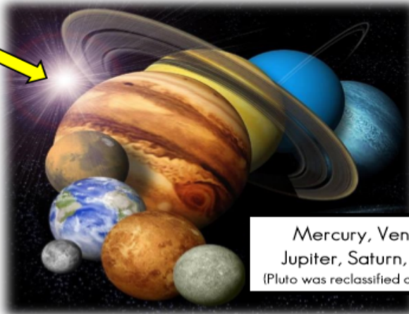
Mercury, Venus, Earth, Mars, Jupiter, Saturn, Uranus, Neptune (Pluto was reclassified as a dwarf planet in 2006)

A star at the centre of our solar system. 15 million degrees hot at its centre. It is 1.3 million times bigger than earth.